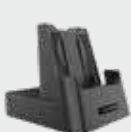
• 94A150095 Single Slot Dock