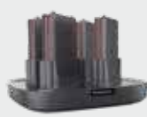
• 94ACC0192 4-Slot Battery Charger