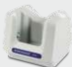
• 91ACC0072 Single Slot Cradle Locking