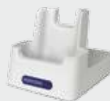
• 91ACC0073 Single Slot Cradle Charge only