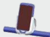
• 91ACC0047 Trolley Holder (60 pcs)