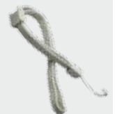
• 91ACC0036 Lanyard