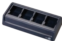
4-slot battery charger