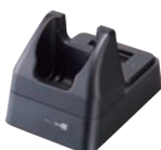
Charging and communication cradle