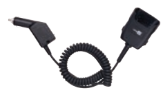
Snap-on car charger