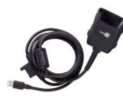
Snap-on cable (USB / RS232)