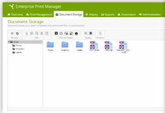
Centralized and secure document repository

Comply with industry standards, control your labeling environment, and quickly respond to label change requests.